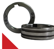
"V" Steel Roller