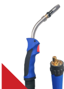
MB24 Euro Torch