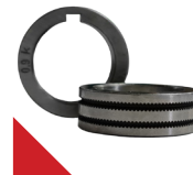
"K" Steel Roller