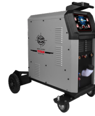
SYN 2000 AC/DC Tig