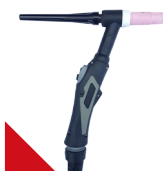
TIG 26 Torch