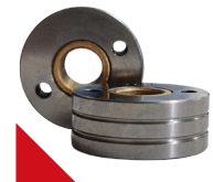
"U" Aluminium Roller