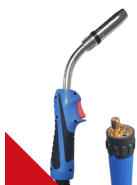
MB36 Euro Torch