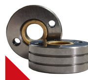
"K" Flux cored Roller