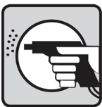
Manual standard filter cleaning