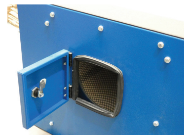
Simple filter cleaning door